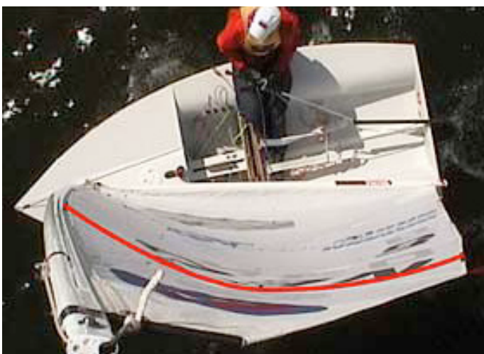
Sailshape in 3-4 m/s, seen through the MastCam lens. You start sitting on the sidetank your legs pressed to the traveller. The traveller is set so that the boom end lies between mid tank and the transom corner.