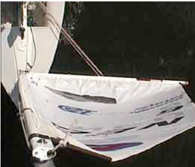
Don't forget to ease the outhaul and the cunningham on the run. (left).