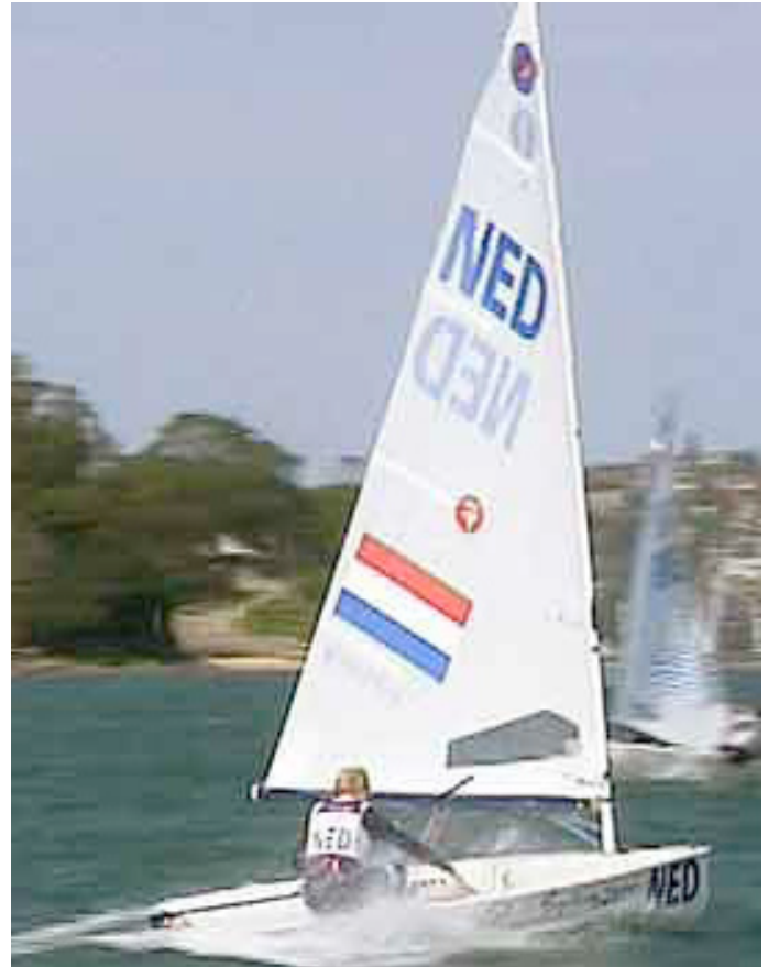
In a breeze, biggest gains are achieved through aggressive sailing downwind.

In 10 m/s the Europe starts to get seriously physical: Smaller helmsmen and -women will suffer against bigger ones. Lift up the centerboard to make it easier to hold the boat upright, smoothen the luff with the cunningham, tighten the outhaul and hike as hard as you can.