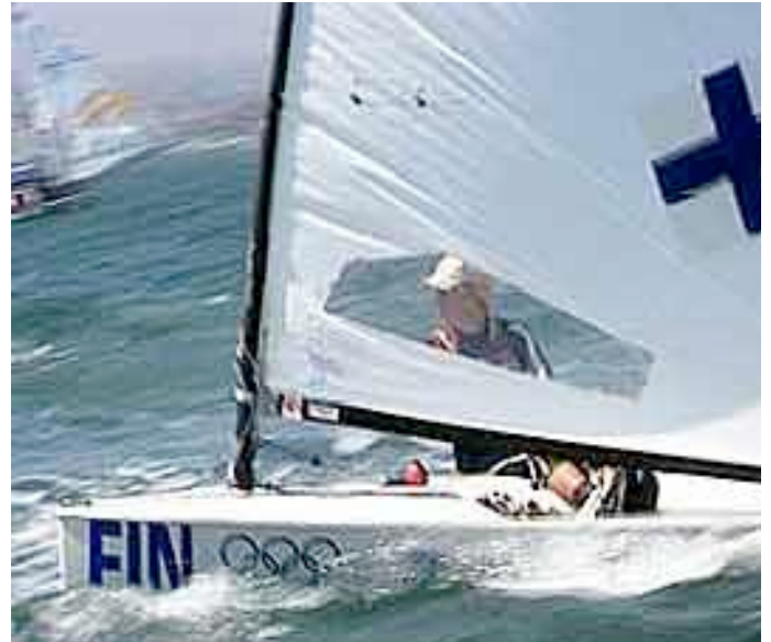
As the wind increases you want to start to tighten things up to flatten and depower the sail. Lean the centerboard aft to balance the helm and sheet the boom to the transom corner.