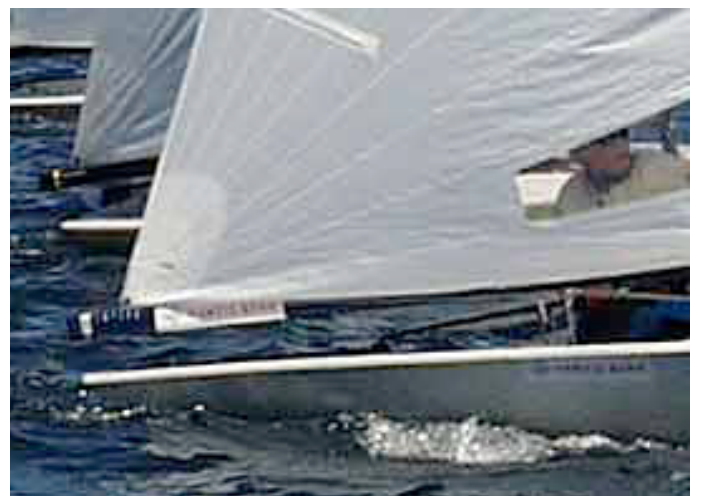
The outhaul is a little looser than in very light airs: 6 to 10 cm from the mark.